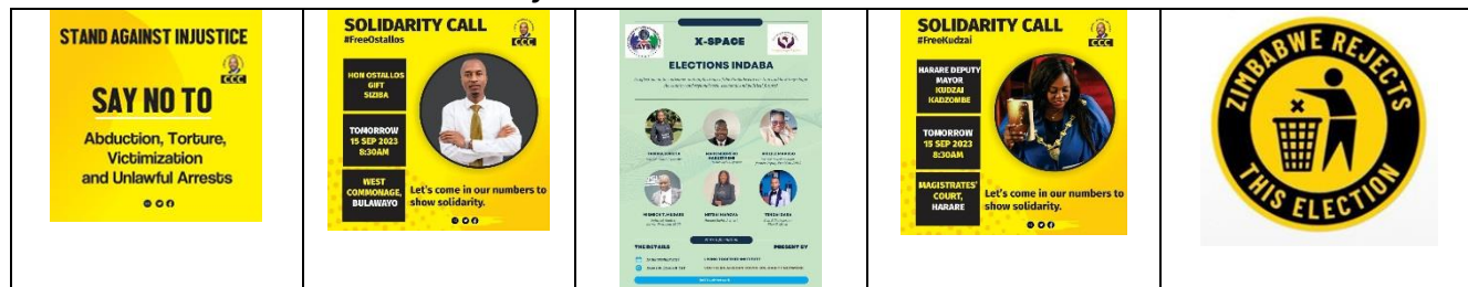
Other protests on 15 th September 2023; Bulawayo, South Africa and Harare